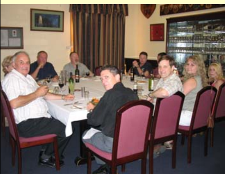
Committee Members, Guest &amp; Friends

A wonderful evening of good food, good wine and company was enjoyed by all. We all look forward to 2007.